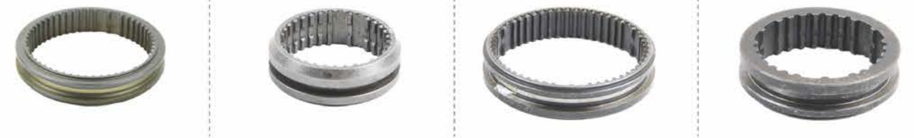
33395-32011 33421-35H02 33421-26071 33421-28040 G52 HIACE HIACE 1992 (TKK-036C)