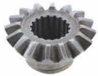
MC-814024 FM 215