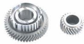
MB-886613 / MB886616 FM145 / FM146 / 85-ON / PAJERO V32