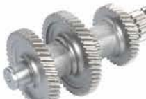
ME-603213 PS89 / PS100