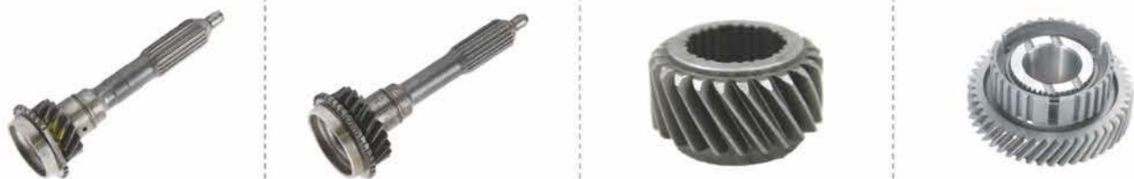
33321-35092 33321-35111 33321-37030 33331-26010 HILUX HIACE 12R