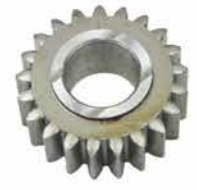
32282-V5001 DATSUN D21 Z21 Z20