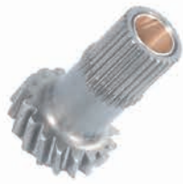
5043 LANDROVER R380