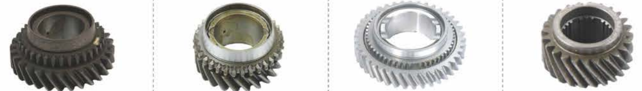
33361-36030 33362-26010 33362-36021 33362-36040 BU30 FJ45 L/C DYNA BY34 BY43