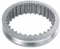
M5R1-15A M5R1 M5R1-19A M5R1 M5R1-21A M5R1 M5R1-36 M5R1