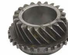
32310-55S50速齒 SY31 720 D21 CEDRIC CARAVAN