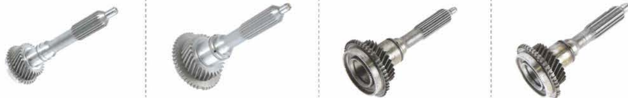
33311-26020 33311-36062 33318-0W010 33318-35030 BU HIACE