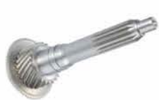
ME-509577 FUSO FE74 FE75 NEW MO35 PS110 PS125 PS137