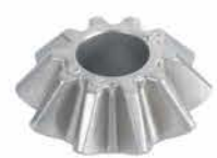
MC-835973 PS120 / 4D34