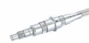
ME-602931 PS120 / FE119