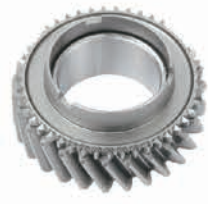
101620 LANDROVER R380