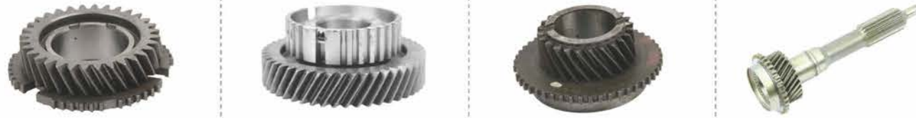
33301-35071 33301-37030 33301-37050 33301-37170 HIACE 1992