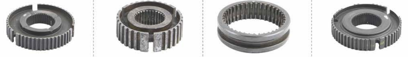
33363-37020 33364-26010 33364-36080 33395-12011 RH11 RH20 LH-11 KF HIACE 12R COROLLA