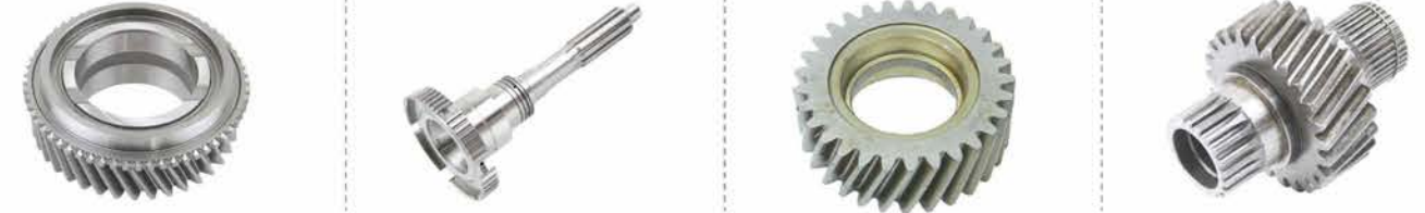
41331-1060 HINO 41331-1320 41331-1330 FM226 41331-1440