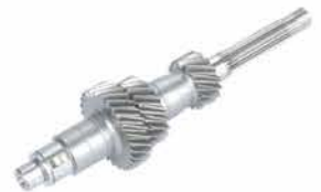
32212-80G04 NAVARRA LATE 4WD CARAVAN