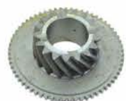
ME-508143 MO35 FE74 FE75 PS125