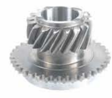
M5R2-15A M5R2 M5R2-19B M5R2-36 M5R2 M5R2 M5R2 M5R2-40A-2ATC