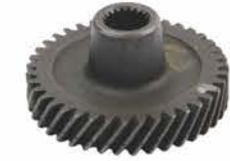
32310-55S50 SY31 720 D21 CEDRIC CARAVAN