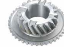
ME-600472 PS100 / FE111 / 2500CC