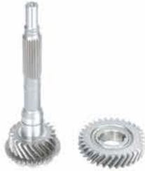
32200-15G51 NAVARRA 4WD